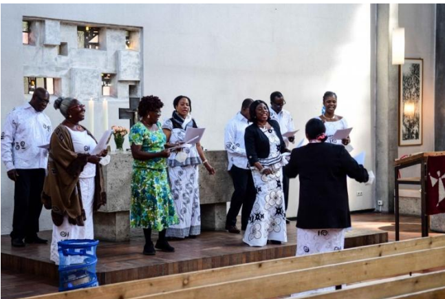
Easter Open Church