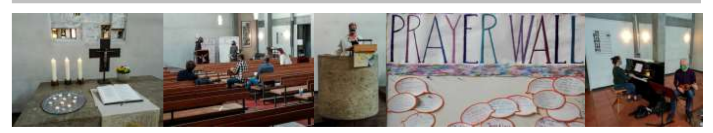
Newsletter of the English-Speaking United Methodist Congregation in Munich: January 2021